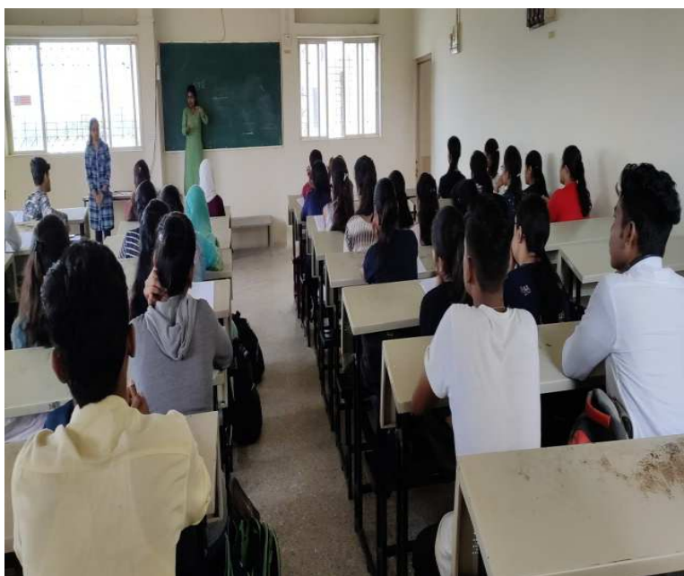
Lecture taken by students

The student volunteers who participated in various activities were appreciated with the gifts as a token of love.