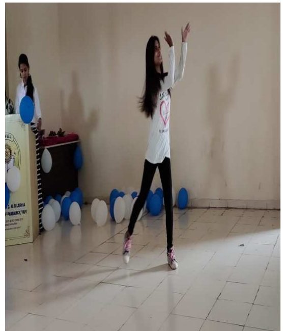
Cultural Programme arranged by students