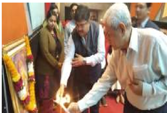
Lamp Lighting by Dignitaries