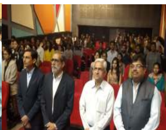
Dignitaries and Delegates standing for National Anthem