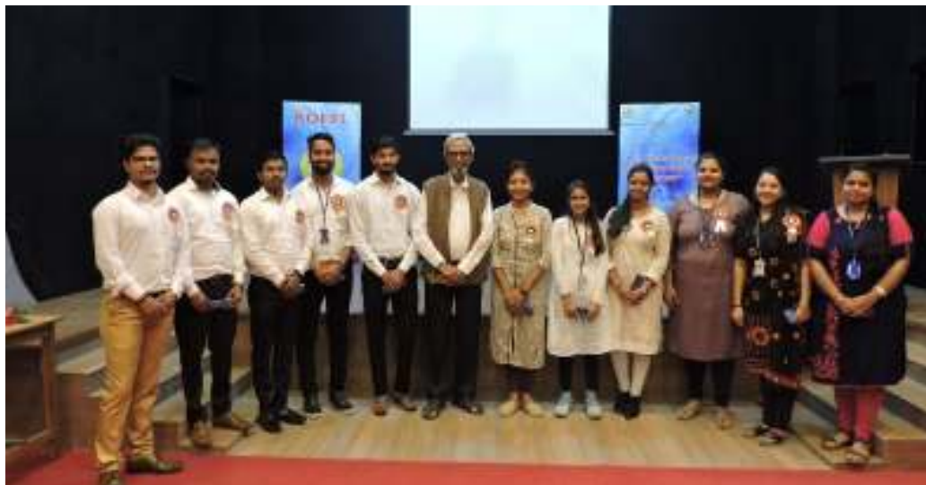
Organising Team (Students Volunteers) of ROFEL Shri G.M. Bilakhia College of Pharmacy of GUJCOST Sponsored Seminar