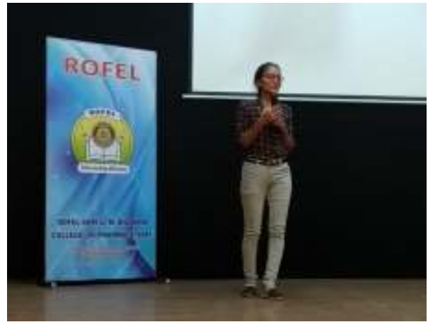
Live Feedback by delegates of Seminar